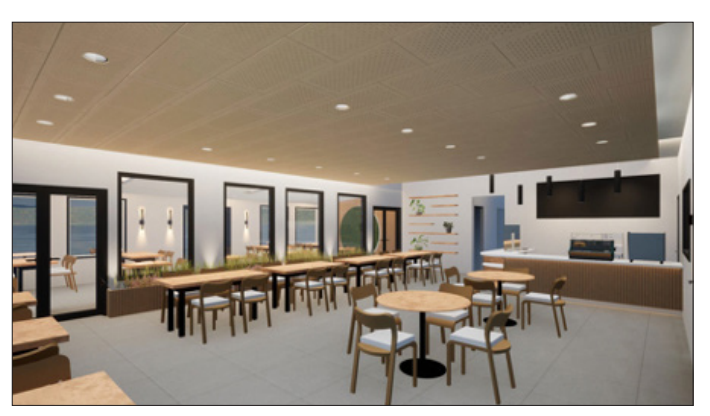
Proposed concept for new restaurant